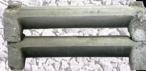
Balusters of various shapes.